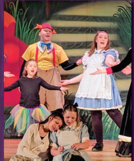
Students deliver a spectacular performance on opening night.