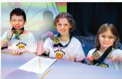
Above: the Book Nerds team from Fairley Elementary School placed sixth in the countywide competition.