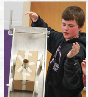
DMK students test their vessels during the recent STEM challenge.