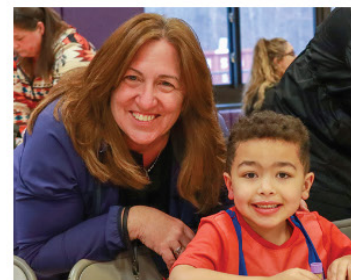
Fairley students enjoy time with their parents and grandparents during a recent family engagement event.