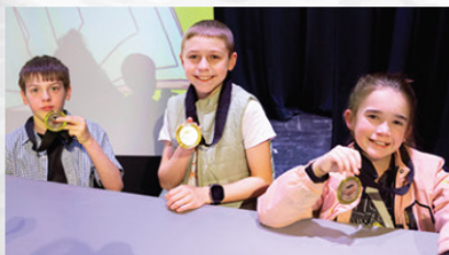
Below: The fifth/sixth grade team from DMK earned third place in the county battle.

Hannibal students recently put their reading skills to the test in the annual Battle of the Books competition, demonstrating their knowledge and recall ability.