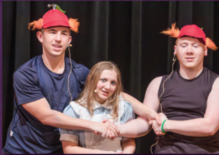
Students portray Tweedle Dee, Tweedle Dum and Alice during dress rehearsals for their recent performance of Disney's "Alice in Wonderland Jr."

Hannibal High School recently brought the magic of Wonderland to life with its spring musical production of Disney's "Alice in Wonderland Jr." The performance, which took place March 28-29, featured colorful