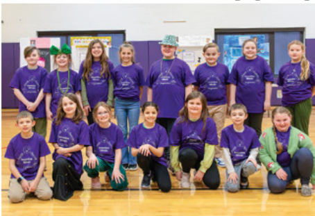
Inventive Minds participants gather for a group photo following the school competition.