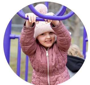
Fairley students on the playground outside of school during Global School Play Day.

"It's hard to measure the success of Global School Play Day, but the smiles on our students' faces says it all," Bird said.