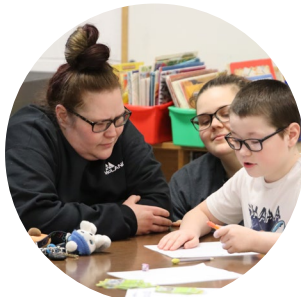
A Hannibal student and his family play a card game during Fairley's Frozen Math Games.