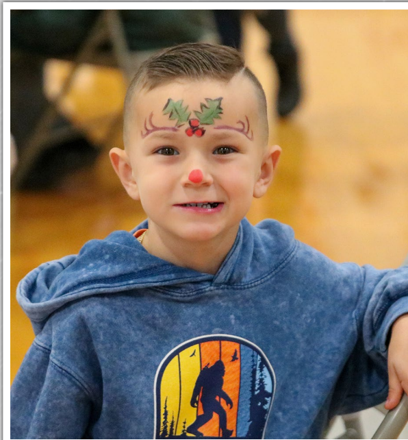
A Christmas Bureau carnival attendee is all smiles after getting his face painted during the event.

The Hannibal Central School District community once again answered the call for help during the holiday season this year, as their generosity made spirits brighter for local families in need.