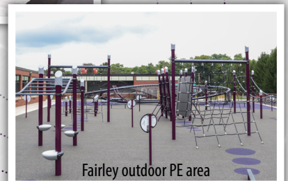
Fairley outdoor PE area