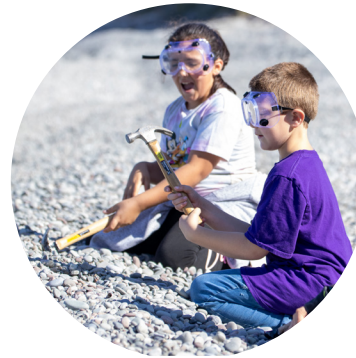
Fairley fourth-graders break rocks during a recent STEM lesson exploring geological features.

A decades-long tradition continued recently as Fairley Elementary fourth-graders headed to Camp Hollis for a day of learning.