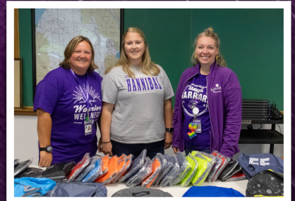
Members of the HFA prepare to give away some of the 120 backpacks the association bought for Hannibal students.