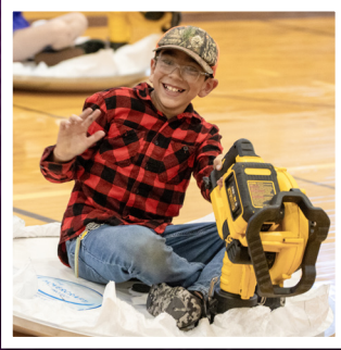
Dennis M. Kenney Middle School fifth-graders race hovercrafts in the gymnasium during a STEM project.

Dennis M. Kenney fifth-graders recently participated in a daylong learning activity where they utilized their classroom knowledge and teambuilding skills to assemble and race hovercrafts throughout the gymnasium.